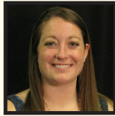
Elana Camp Voice